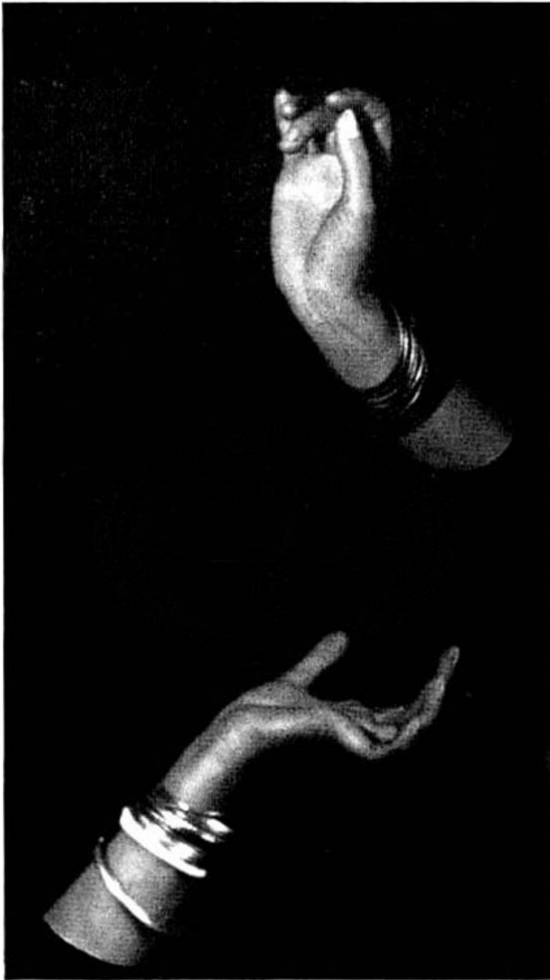
Kataḷa hand (upper)